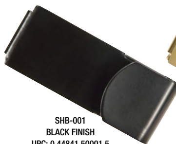
SHB-001 BLACK FINISH UPC: 0 44841 50001 5

Master Carton Includes: 1 Tray Pack with 6 Black Clip Packages 1 Tray Pack with 6 Gold Clip Packages