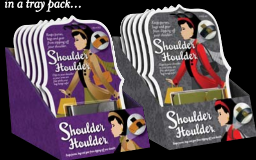
TRAY PACK (6 per pack)