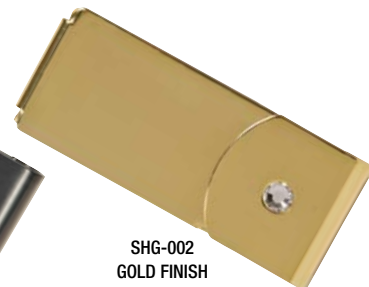
SHG-002 GOLD FINISH UPC: 0 44841 50002 2

* Shoulder Houlder works best on wool, denim, and other substantial fabrics. Not recommended for leather or lighter materials.